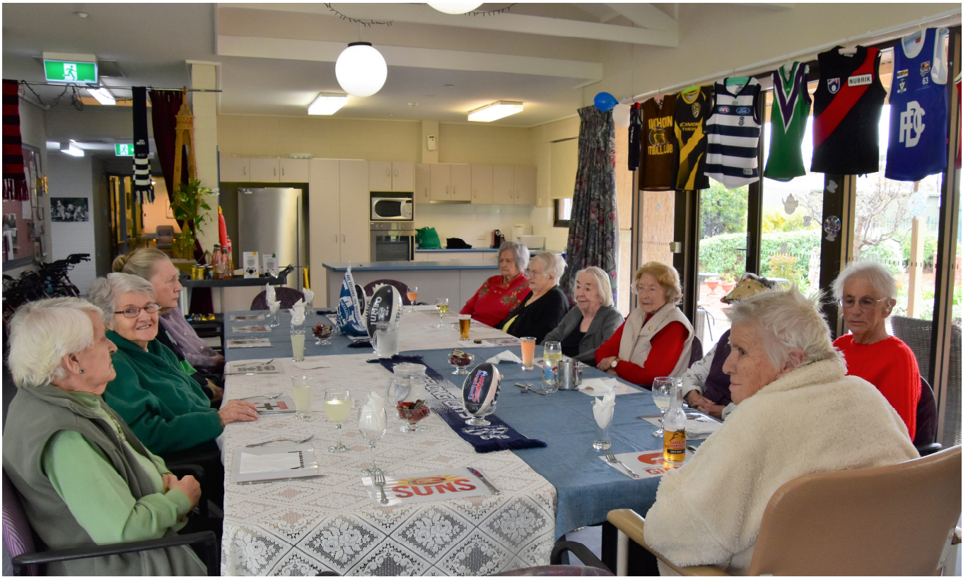
Celebrating Footy colours day with a special lunch in Riverside Lounge