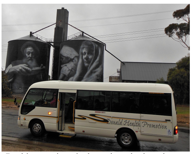
Residents enjoyed a bus trip to look at the art around St Arnaud